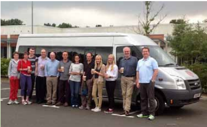
“Cadogans Grousebeaters” team from Glasgow enjoy a brief tea break in Perth en route to the Great Wilderness Challenge 2013, the first for most of them.