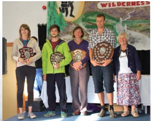
Race Winners 2013